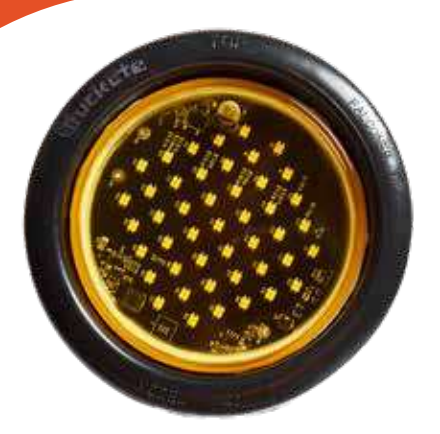
LEDQO-B in a right angle bracket, MB01